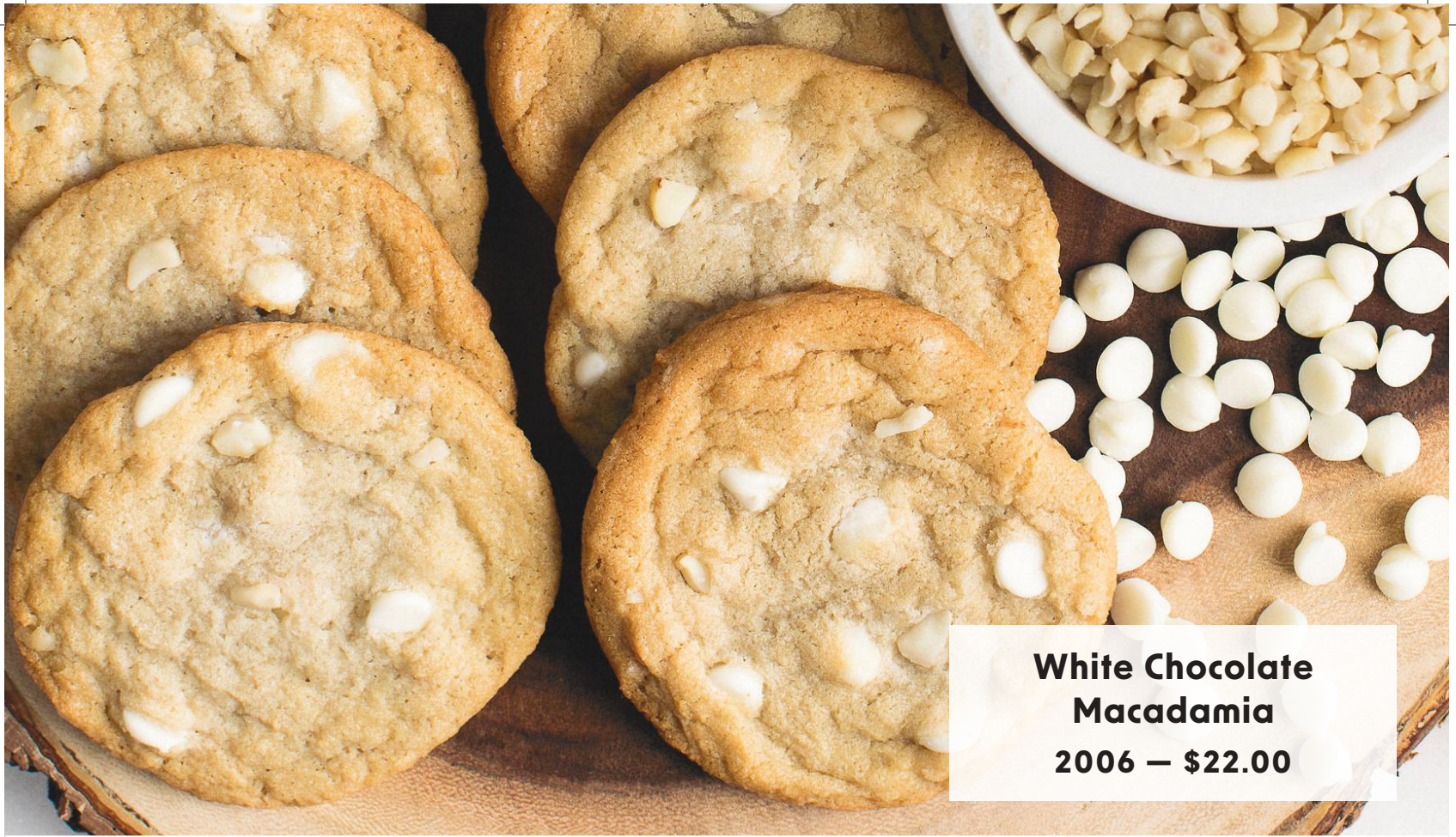
White Chocolate Macadamia 2006 — $22.00