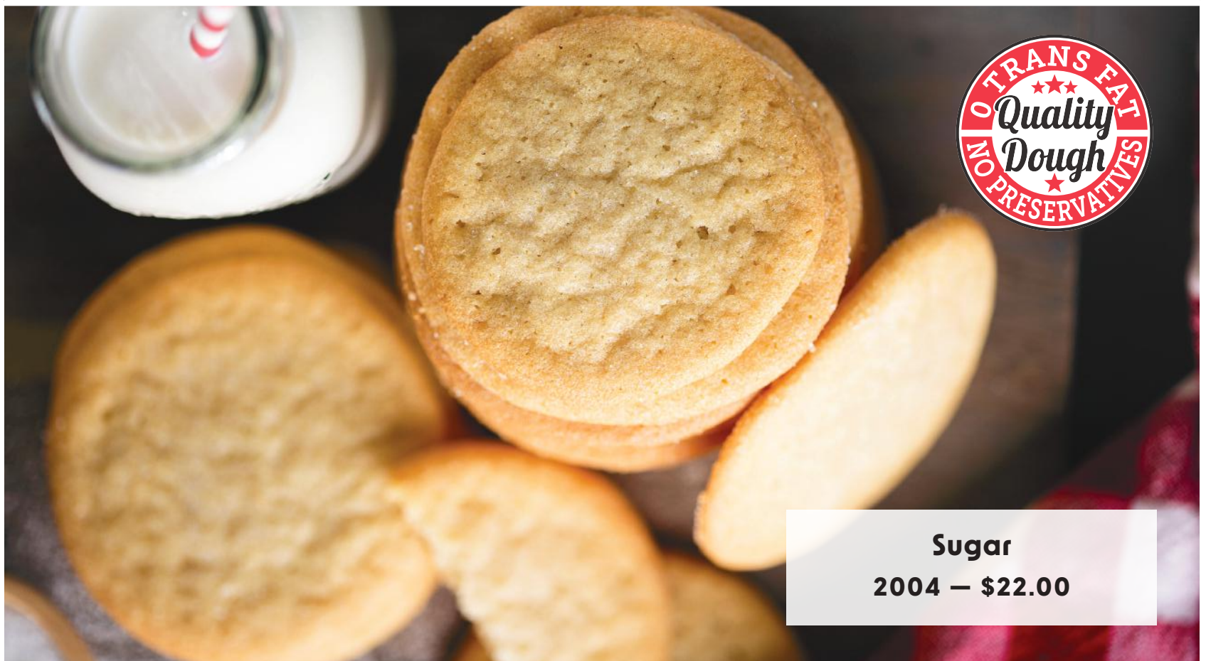
Sugar 2004 — $22.00