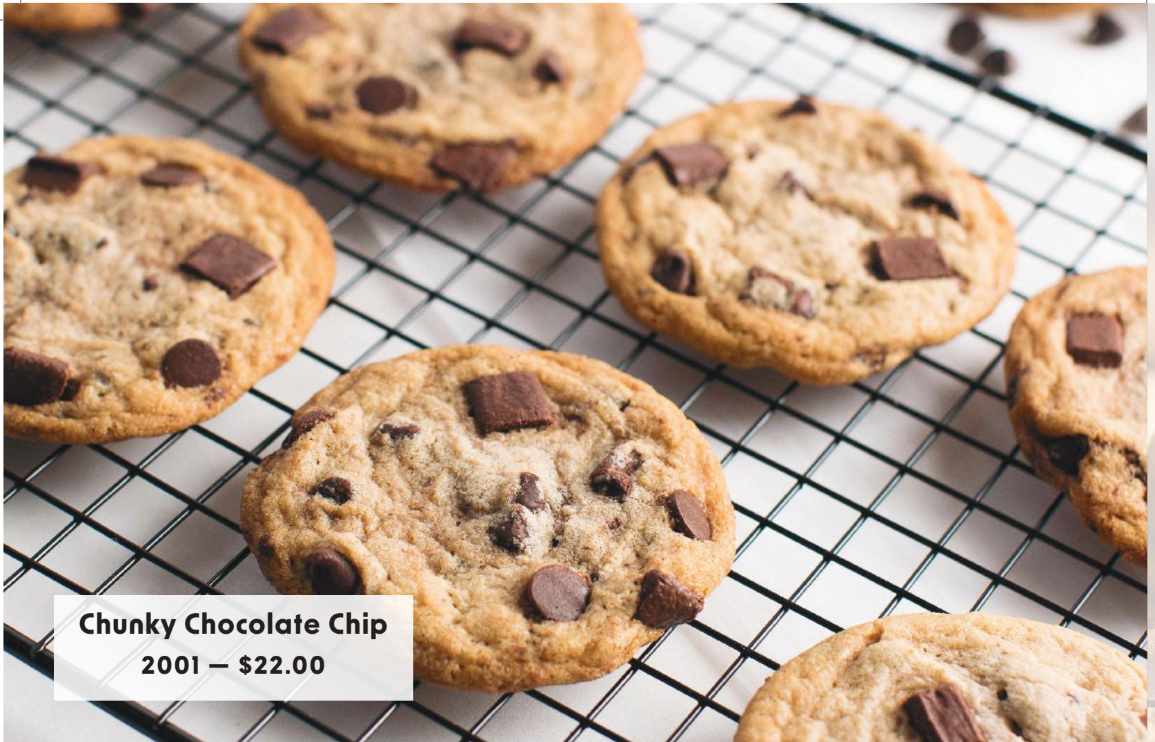
Chunky Chocolate Chip 2001 — $22.00