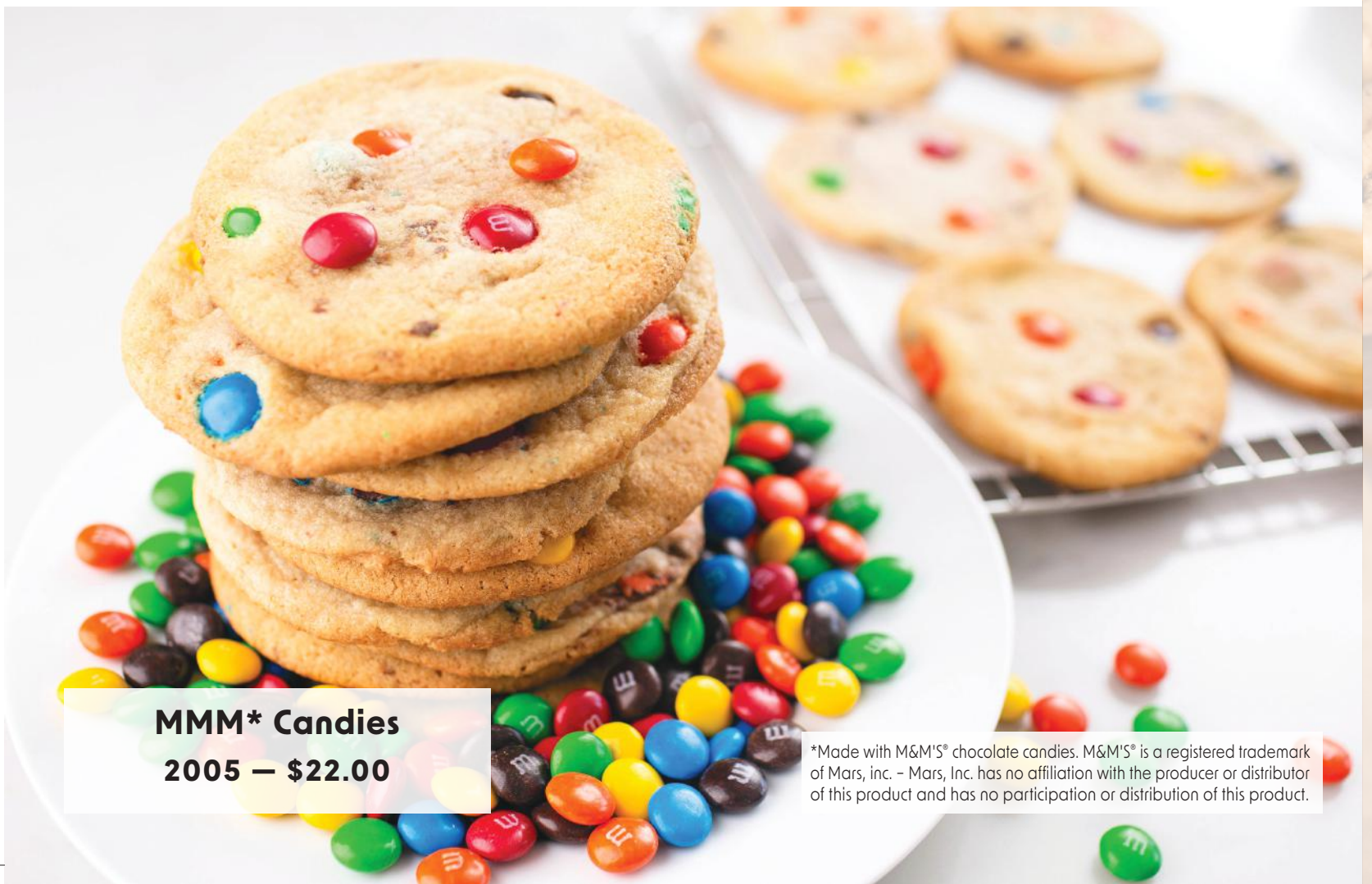
MMM* Candies 2005 — $22.00

*Made with M&M'S® chocolate candies. M&M'S® is a registered trademark of Mars, inc. - Mars, Inc. has no affiliation with the producer or distributor of this product and has no participation or distribution of this product.