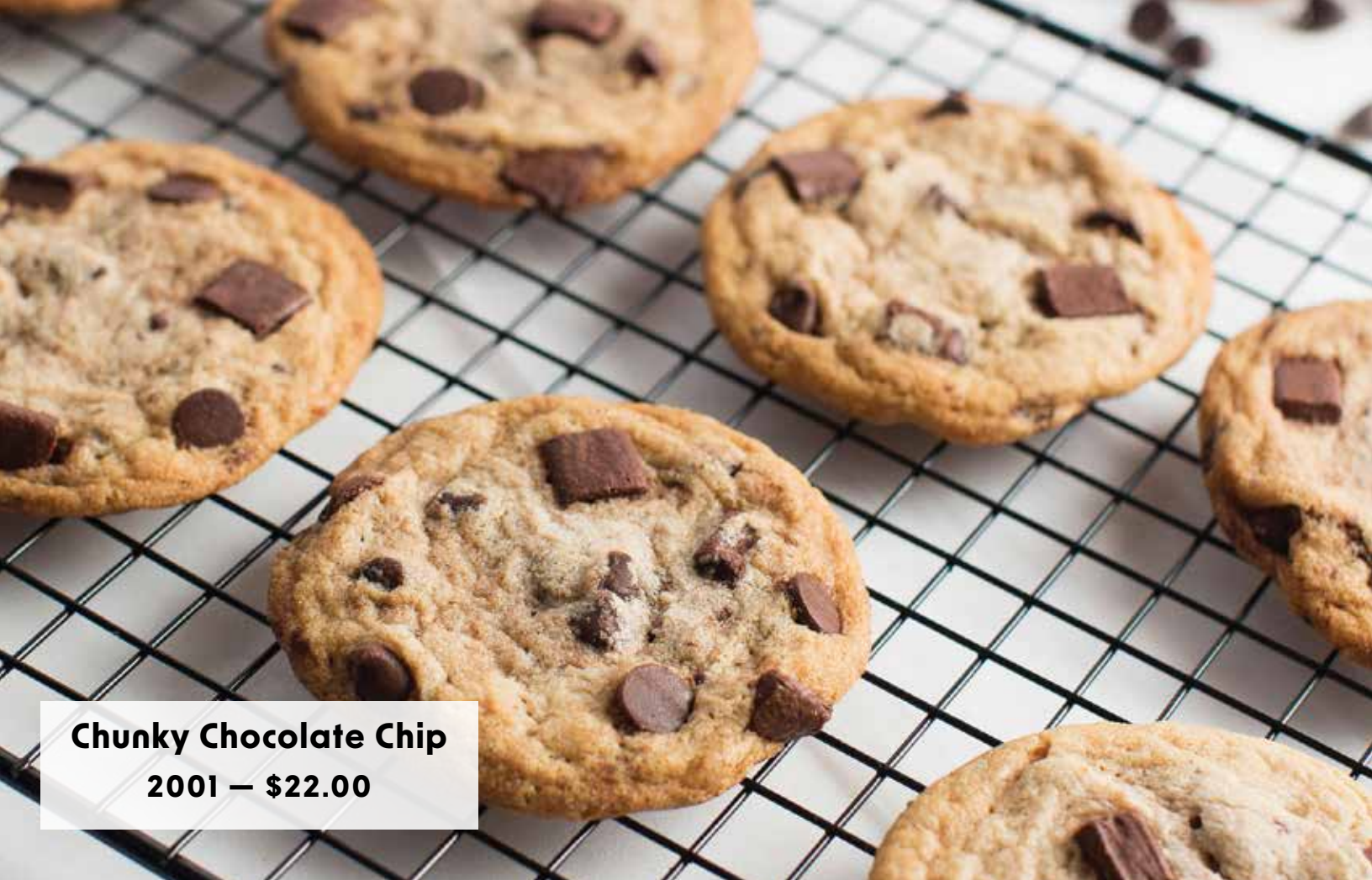
Chunky Chocolate Chip 2001 — $22.00