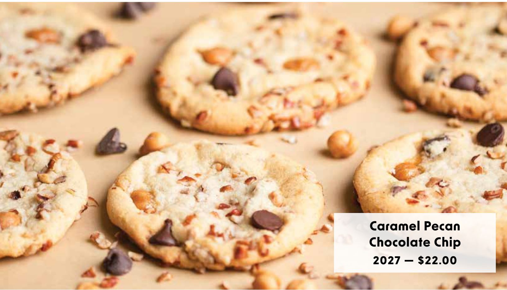
Caramel Pecan Chocolate Chip 2027 — $22.00