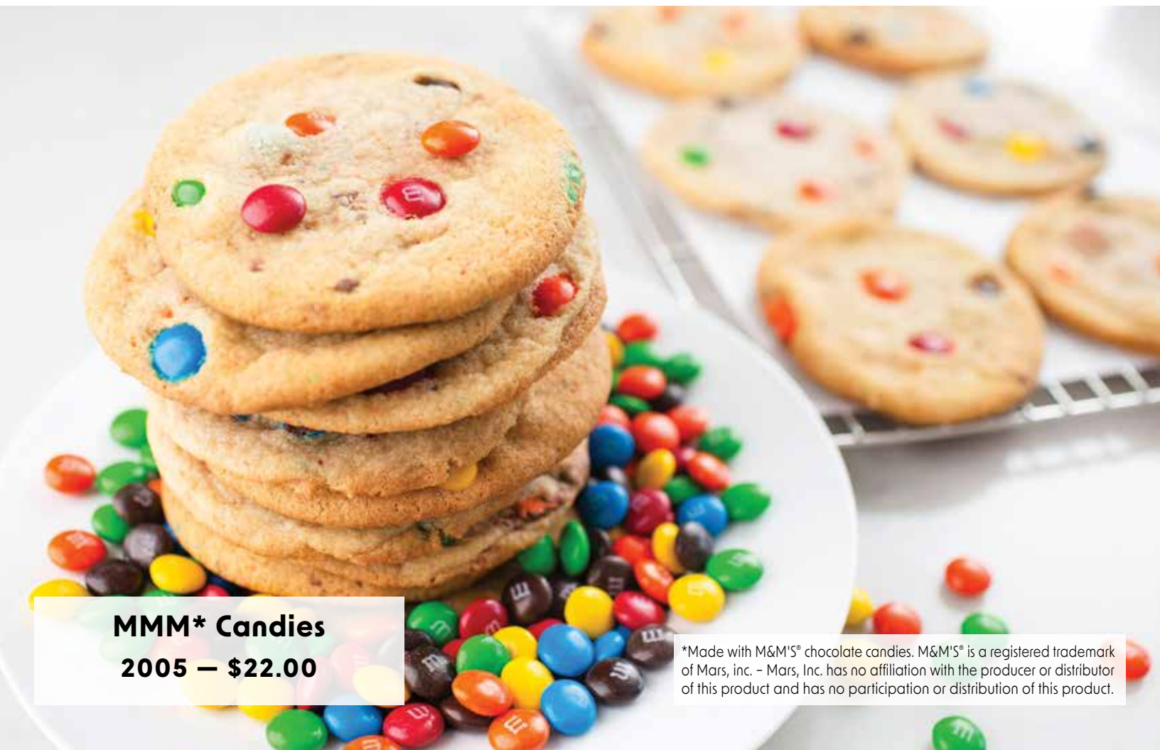
MMM* Candies 2005 — $22.00

*Made with M&M'S® chocolate candies. M&M'S® is a registered trademark of Mars, inc. - Mars, Inc. has no affiliation with the producer or distributor of this product and has no participation or distribution of this product.